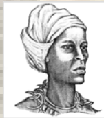
Nanny of the Maroons

The Gilder Lehrman Center for the Study of Slavery, Resistance, and Abolition David Brion Davis, Director Yale Center for International and Area Studies